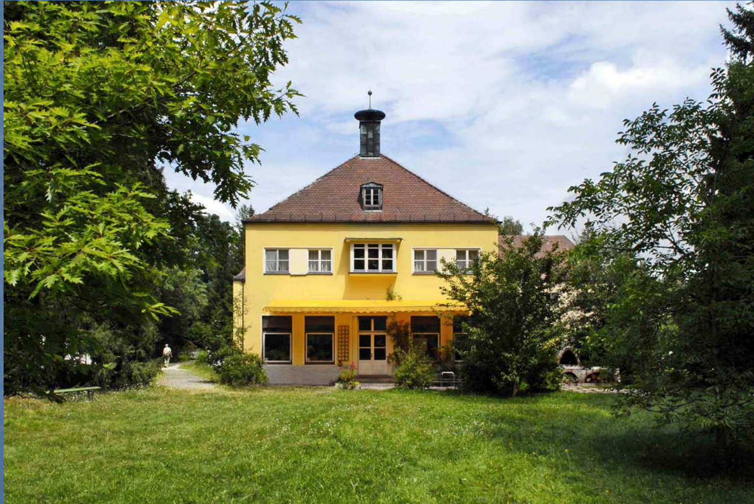
WPA Panel AMEPSA 23.09.2011, Buenos Aires